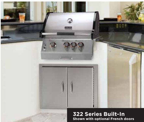
322 Series Built-In Shown with optional French doors